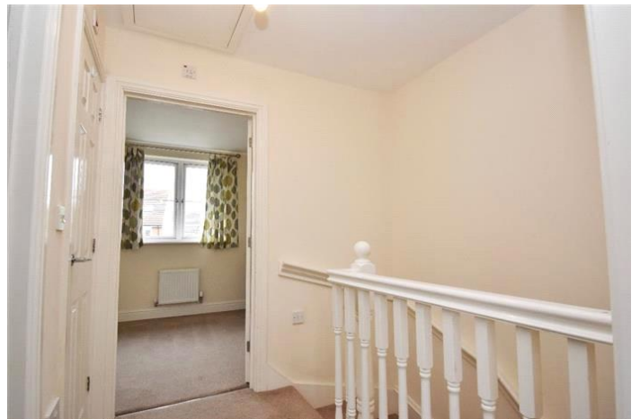
FARMERS ROW, FULBOURN, CAMBRIDGE £1,450 PCM